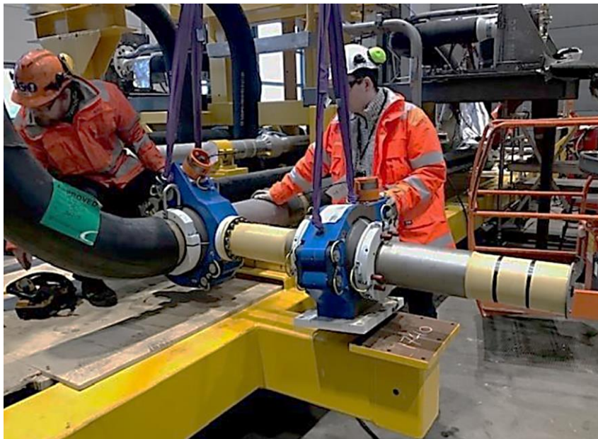
Assembling into manifold module